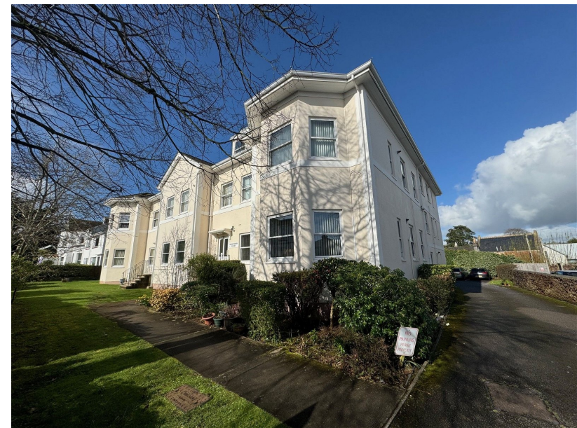
Flat 2 Grosvenor Court

A 2 bedroomed lower floor purpose built flat is ideally situated in a level location for access to Paignton Town Centre and the Seafront. It offers spacious accommodation comprising living room, kitchen, two double bedrooms (with fitted wardrobes), a bathroom and hallway. Benefits include double glazing and gas central heating. There is an entrance lobby and access to the building is via a secure intercom system. Outside there are communal garden areas plus an allocated parking space and communal visitor parking. Viewing is recommended to fully appreciate the property which will be sold with No Onwards Chain.